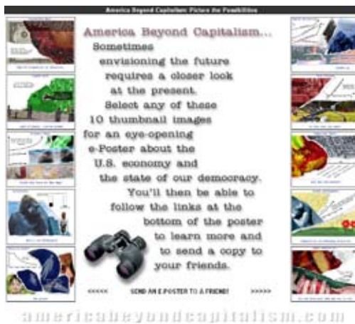
Splash page with e-poster thumbnails americabeyondcapitalism.com

Funding: This IRC interdisciplinary collaboration is being supported in part by funds from the Robert W. Deutsch Foundation.