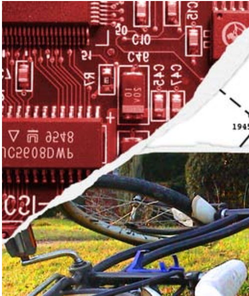
Community Development americabeyondcapitalism.com

A web-based gallery of the posters also referred people to the new book on the subject, America Beyond Capitalism , by political economist Gar Alperovitz. The book suggests that capitalism and socialism never even existed in their truest forms and that neither adequately describe the best wealth building systems now benefiting the middle class.